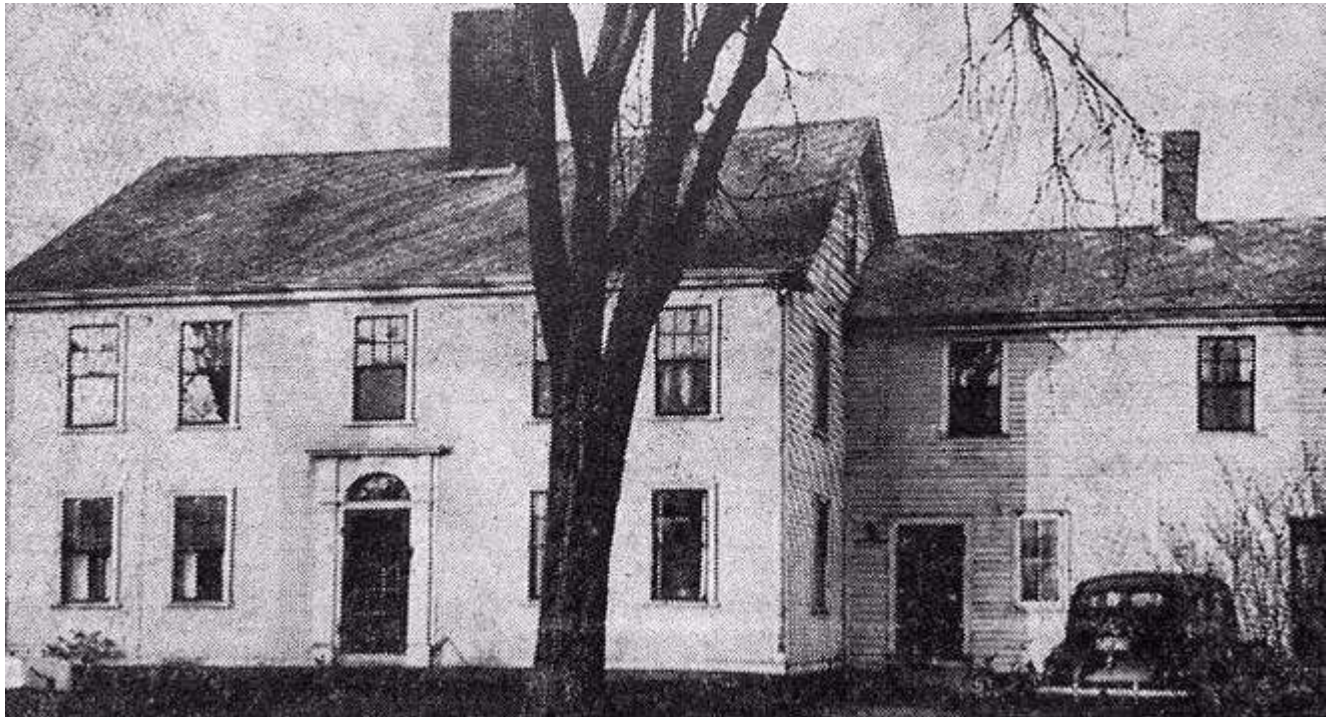
The Mansfield Town Farm, located at the corner of East and Ware streets, was a place for the poor, aged and sick.

This is the second in a two-part series on Mansfield's Town Farm.