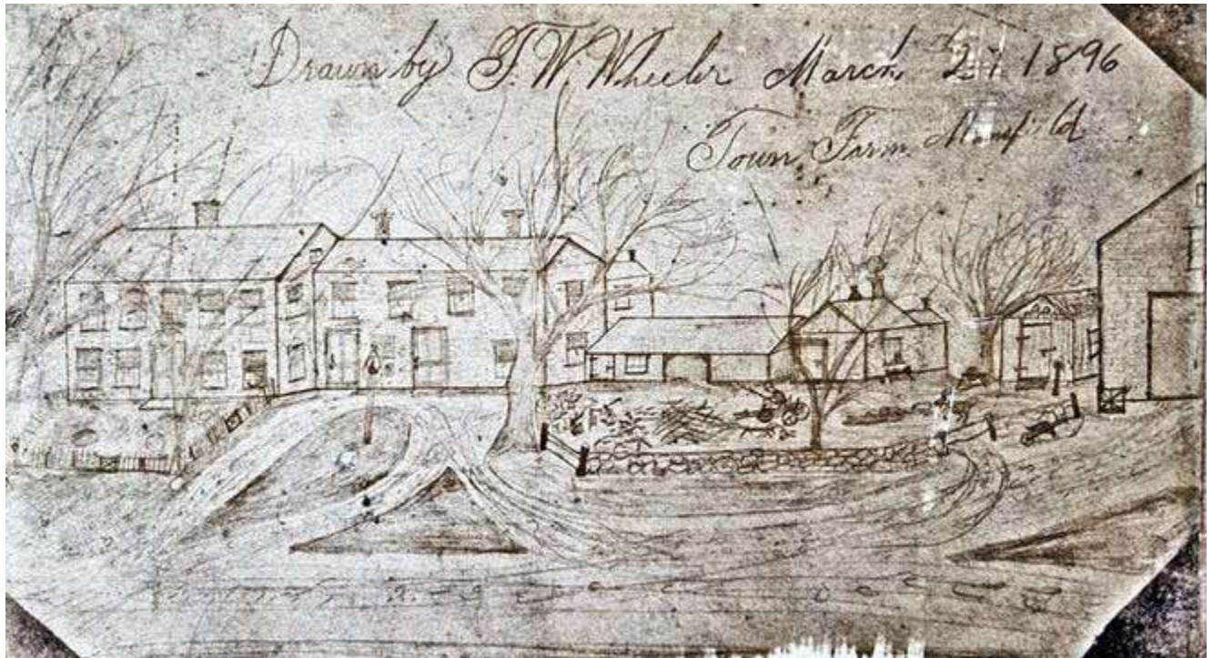
This sketch shows the Mansfield Town Farm in 1896.

Editors at the Mansfield News agreed. In a 1954 editorial titled “Why Sell Now?” they noted the land’s proximity to Memorial Park, the new high school (now Qualters Middle School) and the town dump (now Mansfield Green recycling center).